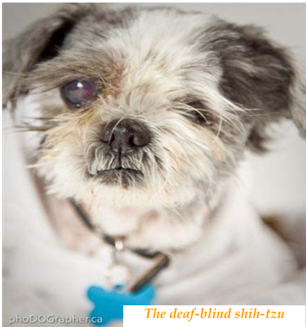
The deaf-blind shih-tzu